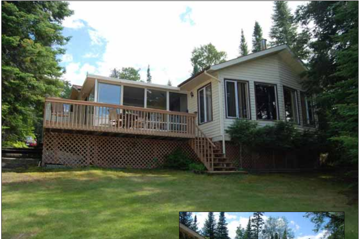
White Lake Lakefront Block 4, Lot 22 4-Season Furnished Cottage $630,000